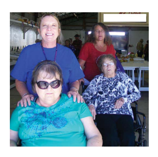
Fun at the Fair!!