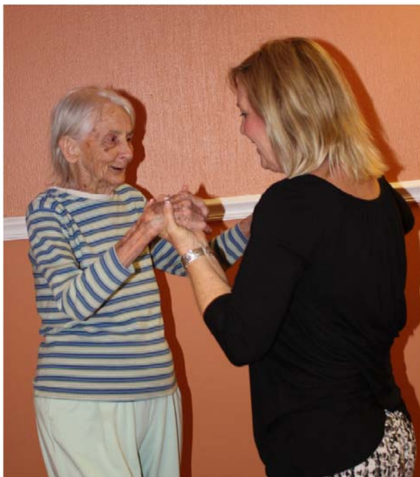
Residents dance down "Memory Lane"

"Memory Lane" helps Residents rediscover lost excitement.