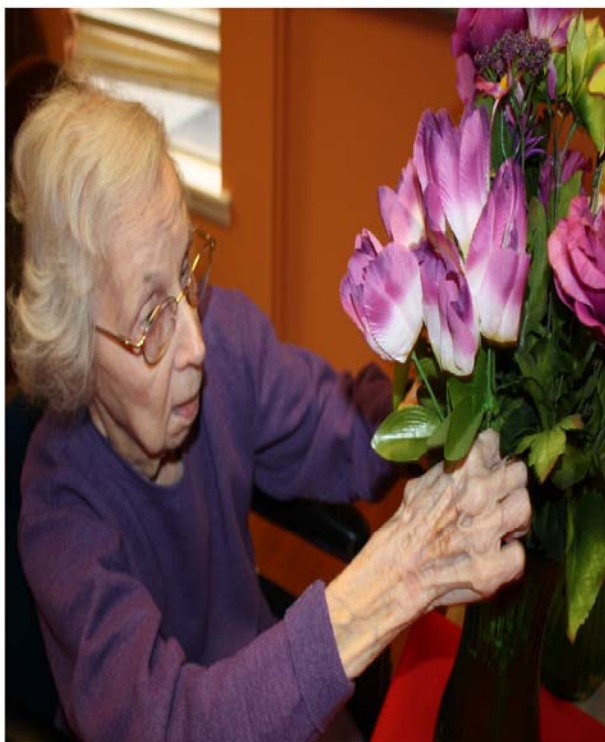
A Resident enjoys “Memory Lane” .

Residents and staff are fully engaged during the activities of “Memory Lane” .