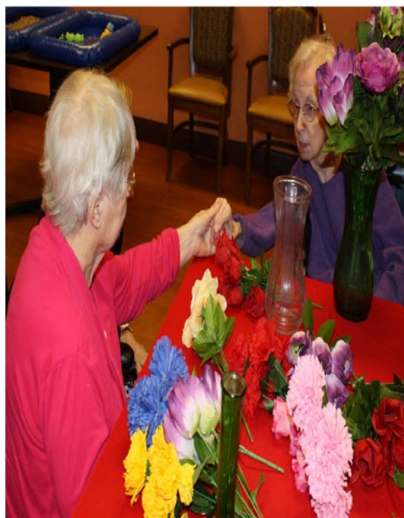
“Memory Lane” encourages Resident socialization as well as good moods.

Residents and staff are fully engaged during the activities of “Memory Lane” .