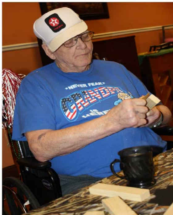
A Resident is determined to get a block of wood as smooth as he possibly can.