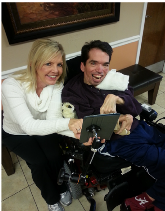
iPad Device is introduced to the Resident for the first time.