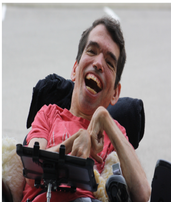
Resident enjoys using his new communication device daily.

Below: Endorphin boosting photos and costume jewelry are set up at different table stations for "Memory Lane" .